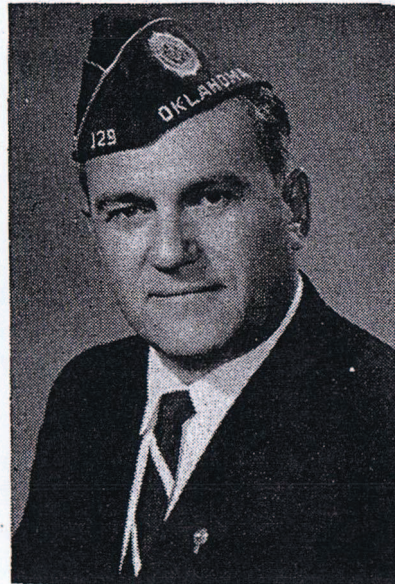
PRESTON J. MOORE National Commander American Legion

Preston J. Moore, national commander of the American Legion, in a statement to this writer, said that the name of “Uncle Sam” Wilson is synonymous with the integrity of the United States Government. He said: “No democracy can endure without men and government of integrity. It is good character moulded by Divine precepts that makes possible free government and a free way of life. . . The kind of integrity ‘Uncle Sam’ Wilson had is the margin of difference today between the forces of freedom and the forces of tyranny. In Godless Communism today there is no decency and therefore no integrity. The Red philosophy holds that the end justifies the means. This puts the premium on deceit, lying and treachery and makes it impossible to place any faith in any promises, pledges and treaties made by Soviet Russia.”